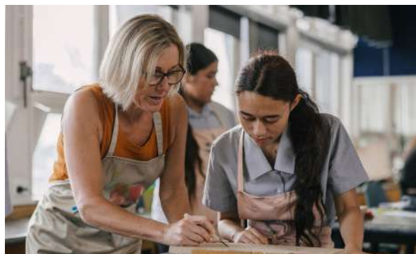
Art and Design