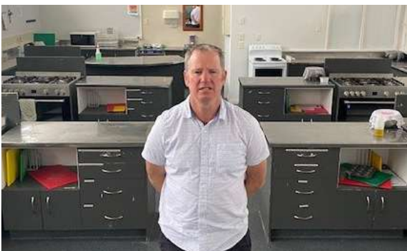
Food & Textile Technology Suites