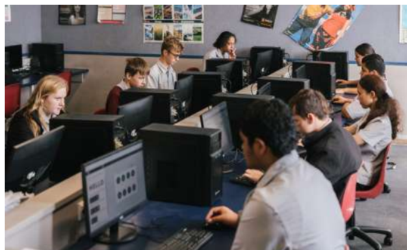
Workshops & Computer Laboratories