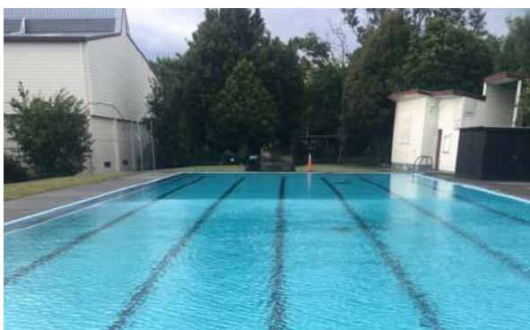
Swimming Pool & Diving Pool