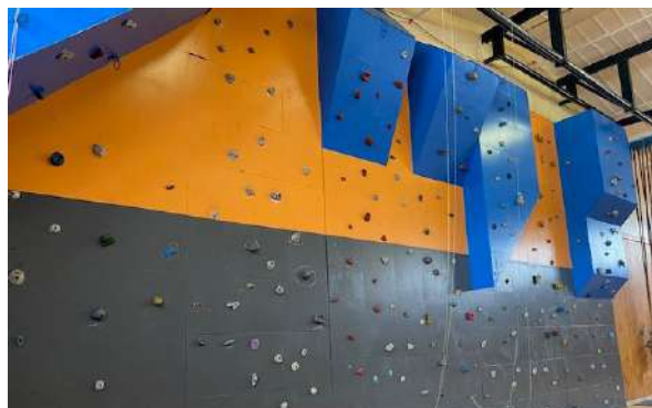
Indoor Climbing Wall