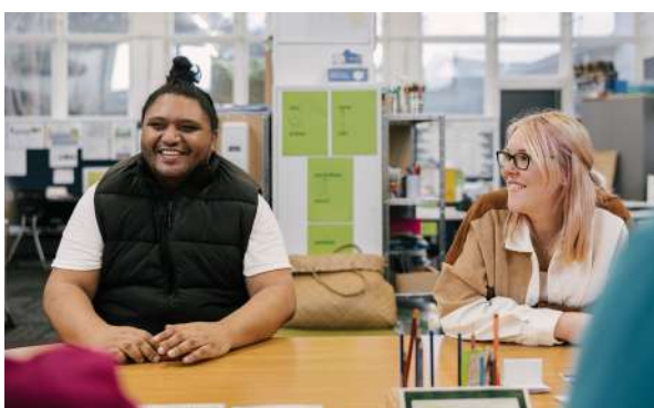
Student Support Centre