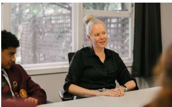
Careers Resource Centre